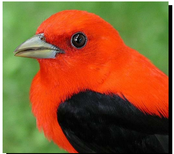
Scarlet Tanager

The 2 nd PBBA is happening from 2004-2008. Birds show breeding behavior almost year round, but especially in the months of May, June, and July. And birds are everywhere! While you are boating or fishing, look for Great Blue Herons, Ospreys, or Belted Kingfishers. Hiking in the forest, you may see a Scarlet Tanager or hear a drumming Ruffed Grouse. Farms and fields are home to Eastern Bluebird, Barn Swallow, and Killdeer. Wild Turkey and several kinds of hawks are even becoming adapted to life in and around cities.