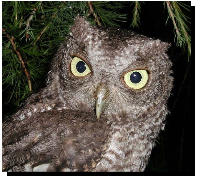
Juvenile Eastern Screech Owl

Are you or someone you know one of the estimated 2.7 million bird watchers in Pennsylvania? Young or old, casual “backyard” bird watcher or avid birder, just beginning or with a lifetime of experience, everyone is welcomed and encouraged to take part in the 2 nd PBBA, the most extensive survey of the state’s nesting birds ever attempted. Even if you haven’t watched birds before now, there is plenty of time to learn how to observe and identify them during the five-year 2 nd PBBA and to help us Monitor Pennsylvanian Biodiversity!