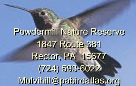
Ruby-throated Hummingbird

Pennsylvania Audubon Cornell Lab of Ornithology Pennsylvania Society for Ornithology Penn State School of Forest Resources Penn State Institutes of the Environment Penn State Cooperative Wetlands Center Pennsylvania Bureaus of Forestry and State Parks