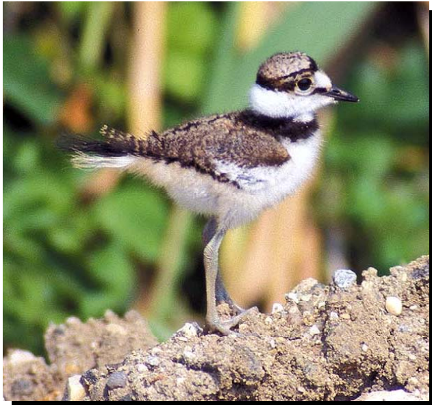
Killdeer chick

From a single record of a robin nesting on your porch post, to a handful of observations of birds seen at a state park while on your family’s summer vacation, to a long list of nesting species you’ve compiled after having spent dozens of hours watching birds in many different habitats in several Atlas blocks— every single participant and every single record adds value and importance to the project. So, if you observe and report a nesting bird, your observation might literally put another of Pennsylvania’s breeding birds on the map, and all records will contribute measurably to the success of the 2 nd PBBA.