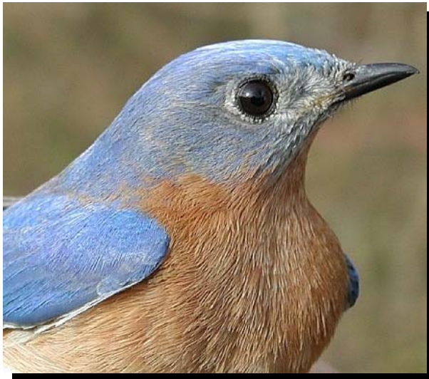
Eastern Bluebird