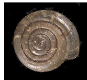
Photo(s): Three views of the low-spired shell Helicodiscus shimeki , by Jeff Nekola ©.